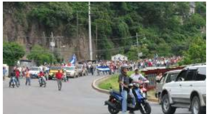
A part of the August 11 th march came from Olancho, a six-day walk.