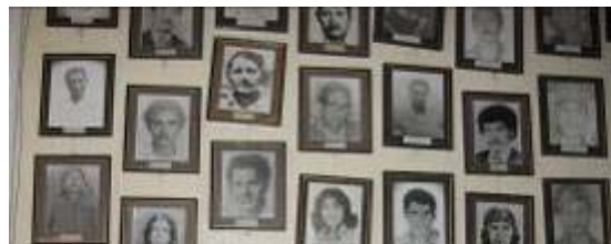
Wall of 1980s disappeared at COFADEH