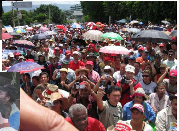
Photos from August 11 Mass Demonstration