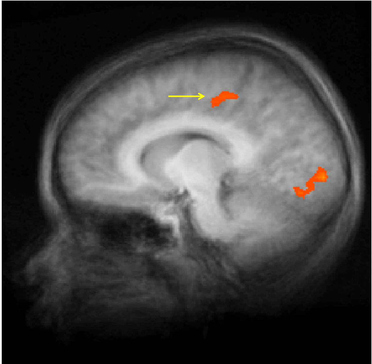
Figure 3. fMRI statistical maps in the sagittal view showing results from food vs. nonfood logo contrasts, coregistered with average structural MRI data from participants. Significance thresholds are set at p < .01 , corrected (cluster-threshold 9 voxels). Arrow highlights greater activation in posterior cingulate cortex.